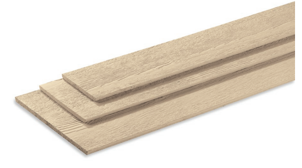
LP<sup>®</sup> SmartSide<sup>®</sup> Trim & Siding features treated engineered wood strand technology that offers protection against the elements.

When selecting fire-resistance-rated wall assemblies, meeting the required rating specified by the code is most important. There are many assemblies with various combinations of materials to choose from. LP<sup>®</sup> SmartSide<sup>®</sup> Trim & Siding, one the most durable siding solutions available, makes a great exterior cladding that can be incorporated with LP<sup>®</sup> FlameBlock<sup>®</sup> Fire-Rated Sheathing or gypsum assemblies. This gives the beauty and durability clients want without sacrificing safety and performance.