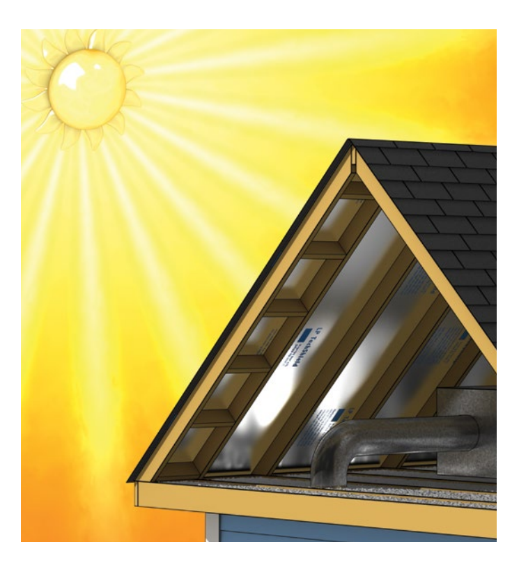
With LP<sup>®</sup> TechShield<sup>®</sup> Radiant Barrier

Radiant heat transferred through conventional roof sheathing panels.