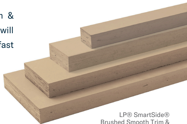
LP® SmartSide® Brushed Smooth Trim & Siding is available in a variety of widths.